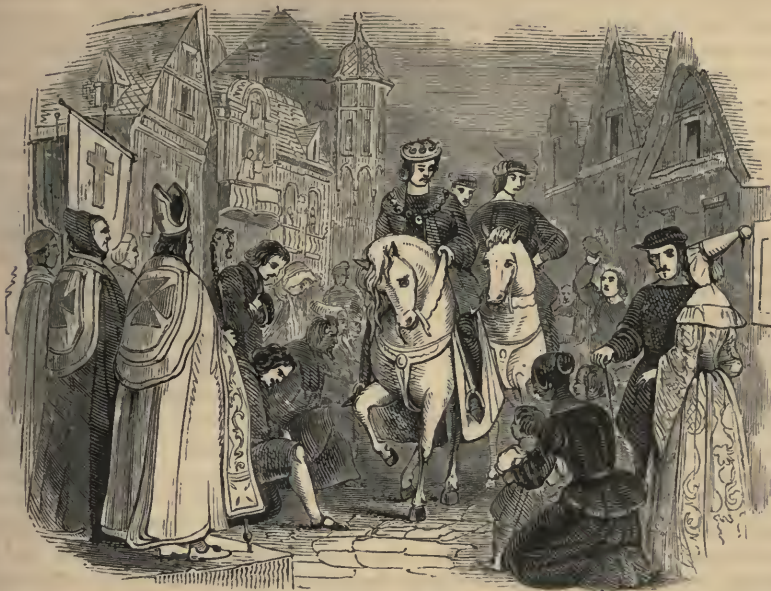
ENTRY OF CHARLES KING OF FRANCE TO BEZIER. Designed from Illuminations of the period.

made him good cheer, joked and laughed with him, and promised him increased honours, in which he was disappointed, as I shall shortly relate.